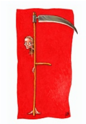
export/sites/universitat-ileida/ca/serve